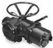
Limitorque® Accutronix MX