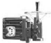
Limitorque® L120 Series