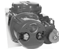
Limitorque® QX Series