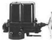
Limitorque® LY Series