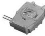
Limitorque® WTR Series